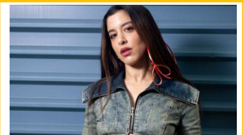
Greece Marina Satti - ZARI